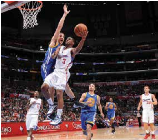
Generously donated by AEG Entertainment and The Smith Family